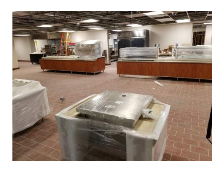
Installation of Kitchen Equipment