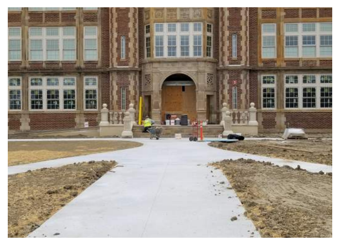
Installation of Stone Rails on Courtyard Entrance