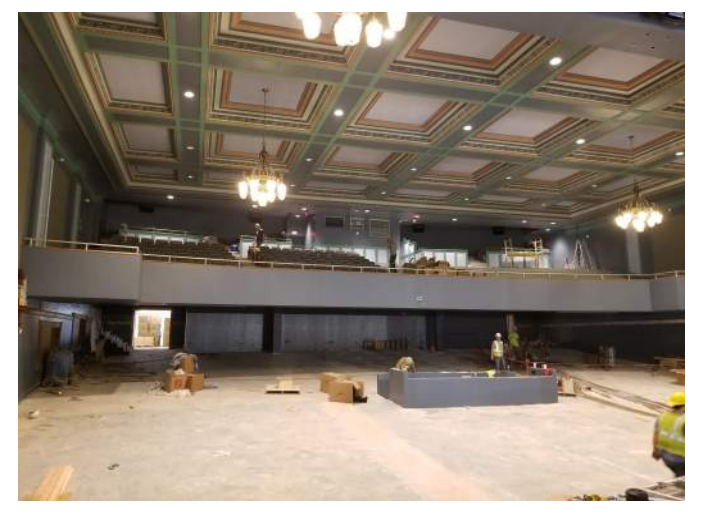
Installation of Auditorium Seating