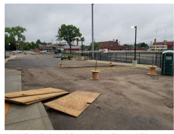
Installation of Crosswalk on East and West Roads