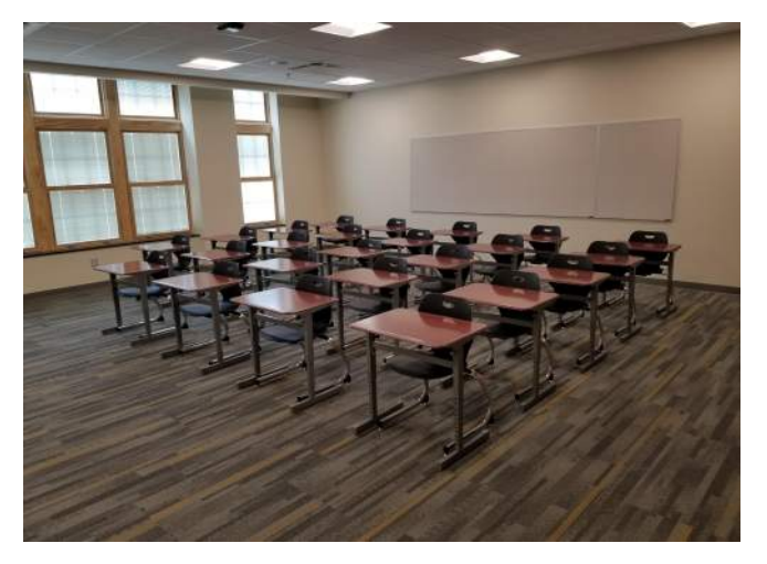
Furniture Installation in Area A 2nd Floor