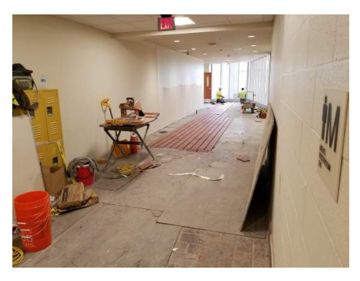
Laying Quarry Tile in Area F 2nd floor